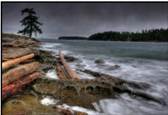
Drumbeg Park