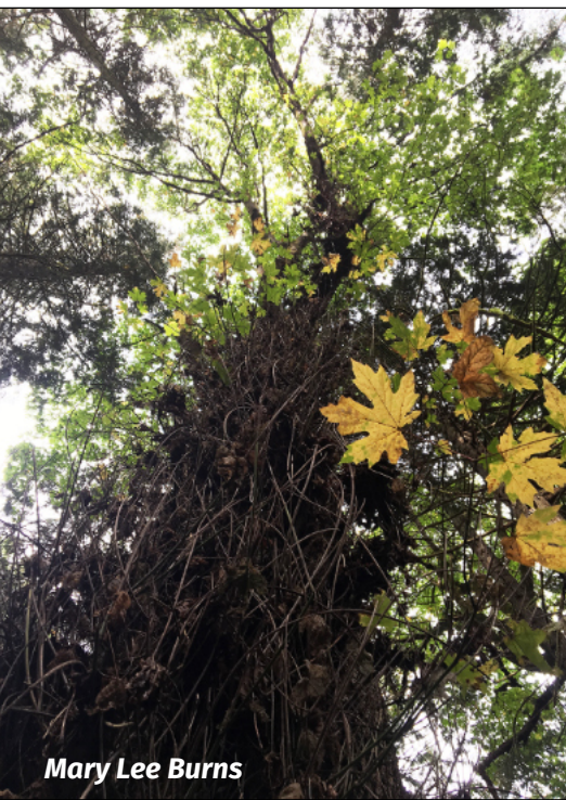
Mary Lee Burns

From the point, continue along the trail towards the Park's north cove and the campground. Continue past the trail leading to the north cove and up the road through the campground. Walk past the closed gate and continue towards Taylor Bay Road until you see the trail marker on the left for a trail that leads to Yogi Trail. Following that trail, cross Taylor Bay Road and enter Cox Community Park by way of River Place Trail. Continue walking until you see the marker for Yogi Trail and turn left.