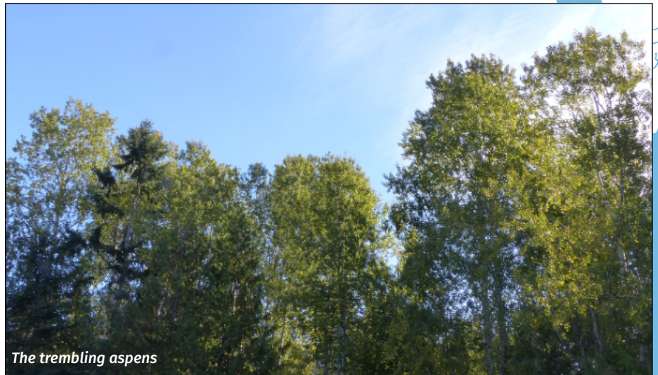
The trembling aspens

The trail soon passes one of several rough beach access paths, beyond which a section of boardwalk helps walkers avoid one of the muddier sections of this route. You then cross a creek on a footbridge constructed by GaLTT trail builders. Stay to your left once over the