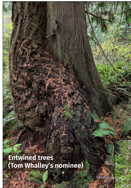
Entwined trees (Tom Whalley's nominee)

Walk up Haig Rd, turn right onto Chichester West and then walk past the trailers on your left. At the telephone pole immediately past the trailers, turn left up the unmarked road. After a short walk you will reach a small clearing. Look right and you will see a water tower and a GaLTT sign directing you to Clarendon Road. Head